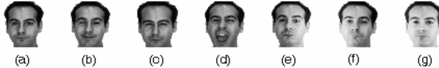
Figure 5. Some sample images of one subject in the AR database.