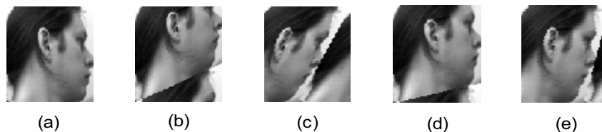
Figure 2. Original image and transformed directional images. (a) Original 2 nd order tensor image; (b) mode-1 directional image with l=2 ; (c) mode-2 directional image with l=2 ; (d) mode-1 directional image with l=4 ; (e) mode-2 directional image with l=4 .

A general framework for independent feature extraction with tensor representation was proposed in this paper. The proposed method learns multiple low-dimension subspaces to extract independent features. A novel mode- k directional image formation was used in training to better exploit the directional information in the mode- k matrix of the tensor. Then the mode- k ICA was presented to learn the subspaces via mode- k directional images and finally the multilinear directional ICA algorithm was presented to extract the IC features, which is also in a tensor form. Compared with the traditional ICA algorithms, the proposed method alleviates significantly the small sample size problem and can preserve better the structural information embedded in the tensor datasets. From the experiments on one palmprint database and two face (UMIST and AR) databases, it can be concluded that the proposed algorithm has higher classification accuracy than many existing unsupervised algorithms such as PCA, ICA and 2DPCA, and even supervised algorithms such as FLD, 2DFLD and Tensor-FLD.