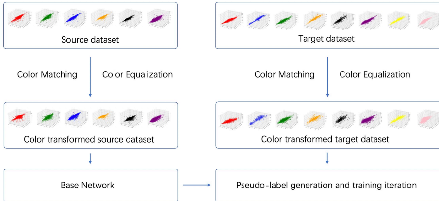
Fig. 3. Pipeline of our training framework. We use Market1501 (6 camera views) as source dataset, DukeMTMC (8 camera views) as target dataset in this figure. After training base network using transformed source data, pseudo-labels are generated from transformed target data with base network. Then progressive learning is applied to train the model in an iterative manner.

Base network training. We use ResNet50 as the backbone network for a fair comparison, as it is used by most of the state-of-the-art methods. We follow the training strategy and network structure in [45] to fine-tune on the ImageNet pre-trained model. We discard the last fully connected (FC) layer and add two FC layer. The output of the first FC layer is 2,048-dim, followed by batch normalization [46], ReLU. The output of the second FC layer is the identity number in the labeled training set. As mentioned in the previous section, we add a pre-processing step to make our model invariant to color statistic changes.