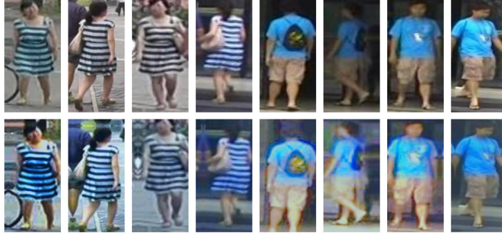
Fig. 4. Samples of color equalization augmentation of different views of Market1501. The first row are originals, the second row are the images after color equalization.

The clustering and training process is kept several times until iterations.