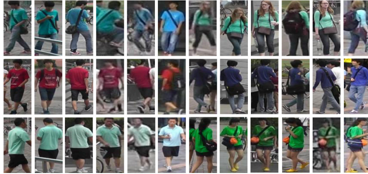
Fig. 1. Samples of color changes of different camera views of Market1501. The column 1-6 and 7-12 are sampled from camera view 1 to 6 respectively. As we can see the camera view 6 (column 6,12) is very different from other camera views.

Market1501, DukeMTMC) are different from ImageNet. Therefore, matching the color statistics of the source and target ReID dataset with ImageNet would reduce the domain discrepancy. Another observation is that the image distribution of camera views are inconsistent due to the camera sensor variation. As we can see from Fig. 1, the color of the clothes of the same person looks different under different camera views. The color mean statistic of six cameras in Market1501 in Fig. 2 shows that there are clear differences in input color distribution of different cameras. This observation motivates us to make color statistics of all the cameras be the same. More specifically, we use a linear transformation to match the first-order statistics (mean) and second-order statistics (covariance) of input images with ImageNet statistics.